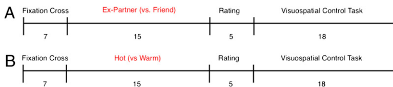
Fig. 1. Time course of Social Rejection and Physical Pain trials. The Social Rejection and Physical Pain tasks each consisted of two consecutively administered runs of eight trials (i.e., 16 total trials). The order of the two tasks was counterbalanced across participants. (A) Each Social Rejection trial lasted 45 s and began with a 7-s fixation cross. Subsequently, participants saw a headshot photograph of their ex-partner or a close friend for 15 s. A cue phrase beneath each photo directed participants to think about how they felt during their break-up experience with their ex-partner or a specific positive experience with their friend. Subsequently, participants rated how they felt using a five-point scale (1 = very bad; 5 = very good). To reduce carryover effects between trials, participants then performed an 18-s visuospatial control task in which they saw an arrow pointing left or right and were asked to indicate which direction the arrow was pointing. Ex-partner vs. Friend trials were randomly presented with the constraint that no trial repeated consecutively more than twice. (B) The structure of Physical Pain trials was identical to Social Rejection trials with the following exceptions. During the 15-s thermal stimulation period, participants viewed a fixation cross and focused on the sensations they experienced as a hot (painful) or warm (nonpainful) stimulus was applied (1.5-s temperature ramp up/down, 12 s at peak temperature) to their left volar forearm (for details, see Methods ). They then rated the pain they experienced using a five-point scale (1 = very painful; 5 = not painful).